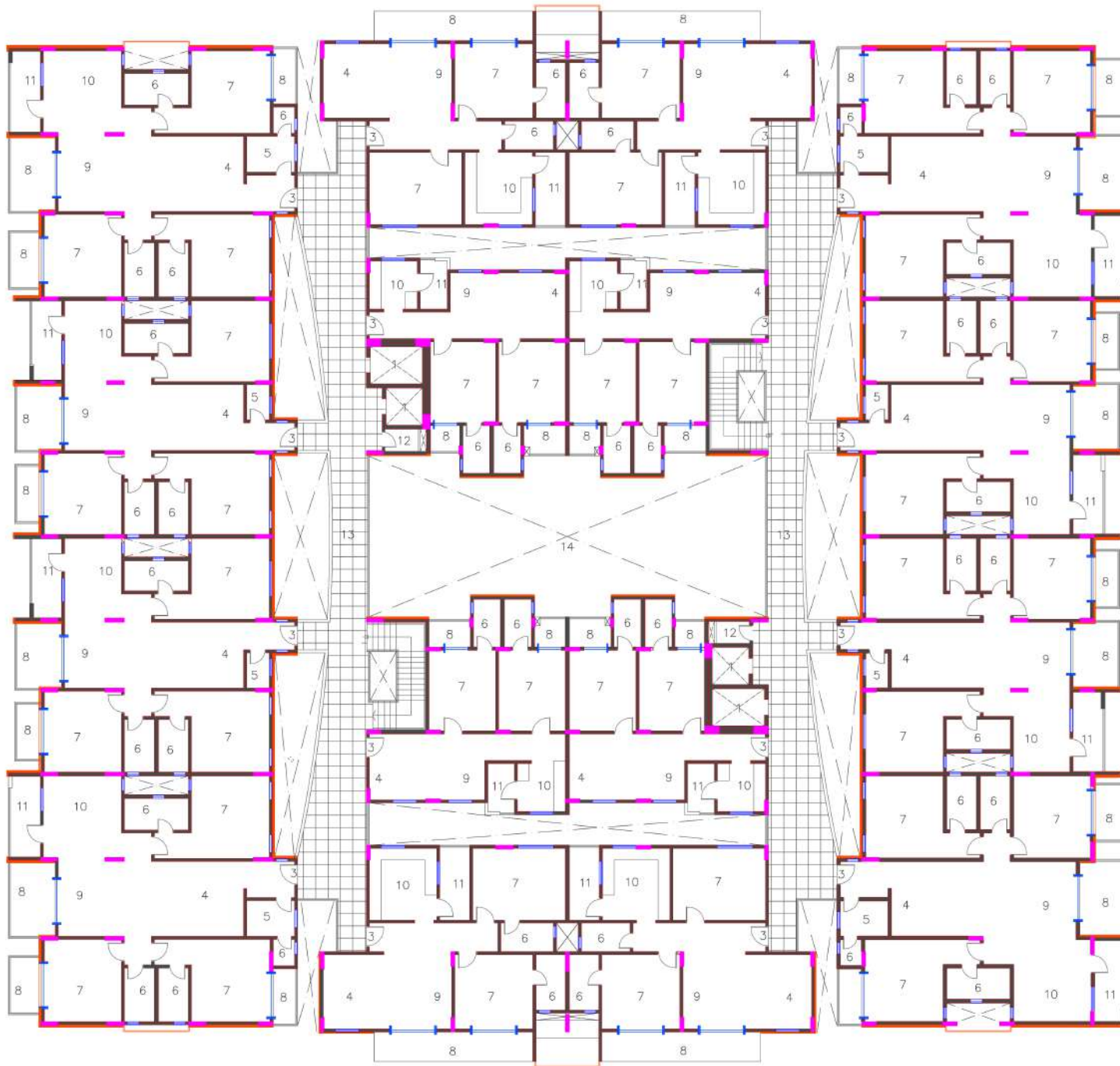
1ST,2ND AND 3RD FLOOR PLAN(TYPICAL FLOOR)