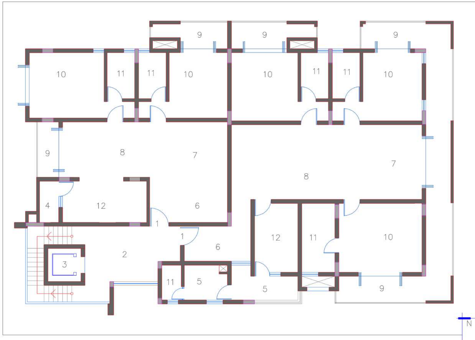
1ST,2ND AND 3RD FLOOR PLAN(TYPICAL FLOOR)